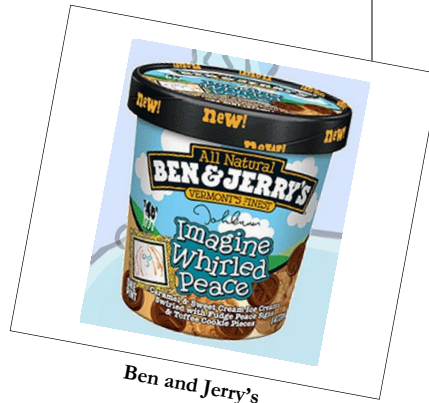
Ben and Jerry's

University's Creamery but clueless when they officially opened their ice cream parlor in downtown Vermont about the fact that they have got their feet wet with a future-empire.