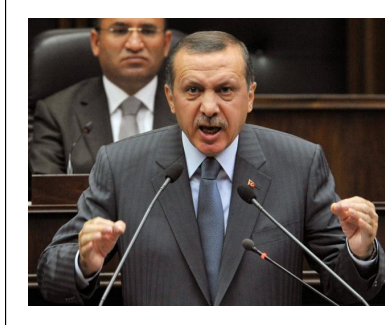
Turkish Prime Minister

Turkey as a new actor Amidst debates about Turkey's new axis, there is a constant chant of praise that is increasing in volume, coming from the West. European publications and periodicals now seem to be patting Turkey