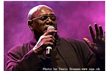
Mighty Sam McClain

Of course, I can't say anything if you think that everything in your life goes well and you don't need a change. This is just a little motivating script for people who needs a change. What more can I say, go for it people!