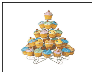
Cupcakes Bon Appetit!

*Cook's Note: Add more sugar to get this consistency.